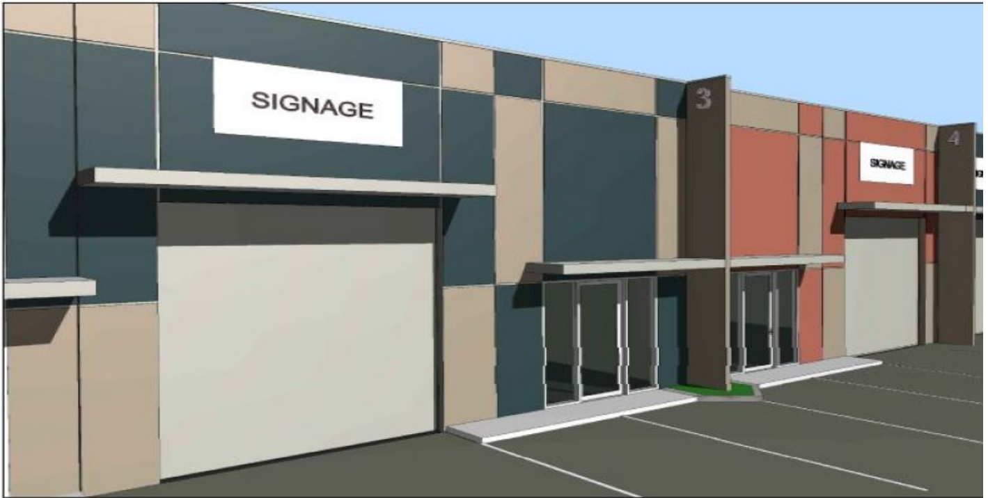
LOT 107 INGRAM ST, NORTH WEST CAPE, EXMOUTH FOR ILLUSTRATION PURPOSES ONLY. REFER TO ARCHITECTURAL PLANS FOR DETAILS ON PROPOSED BUILDING.